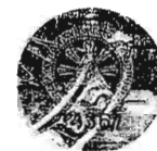
EDUARDO R. ERMITA Executive Secretary